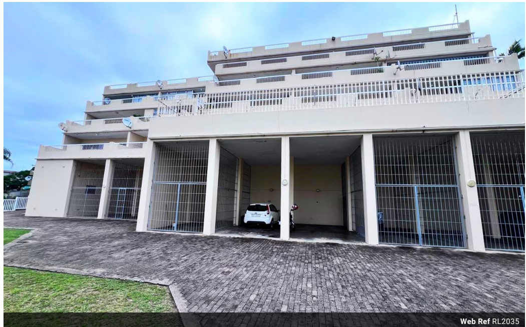
Web Ref RL2035

No 1 Bank Street (Corner Bank Street and Marine Drive) Margate KwaZulu Natal