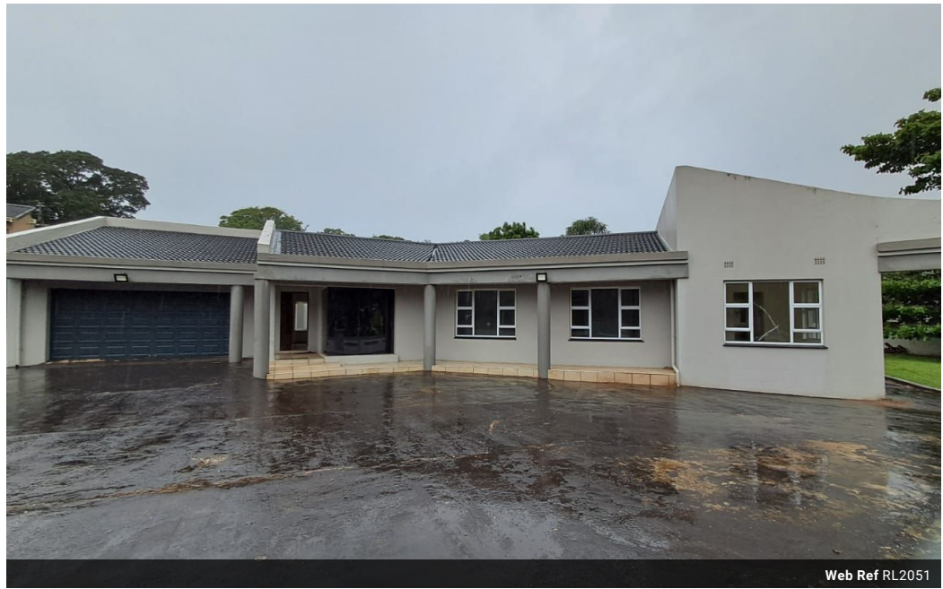
Web Ref RL2051

No 1 Bank Street (Corner Bank Street and Marine Drive) Margate KwaZulu Natal